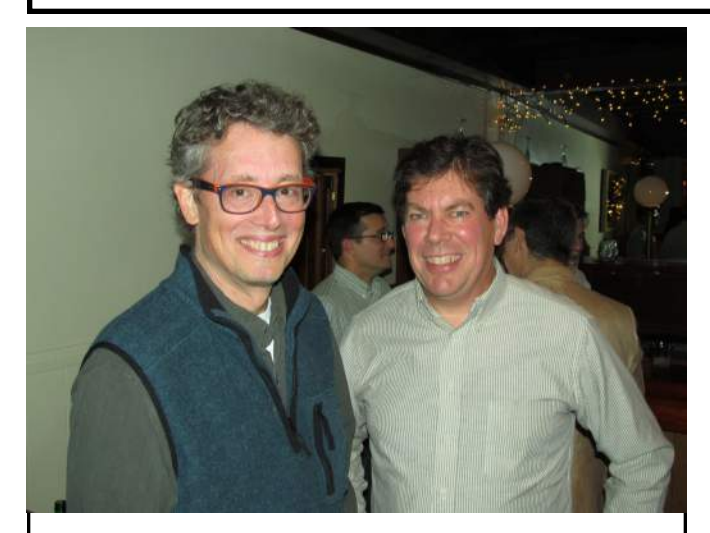
Fellow hammers Pete S and Rich A discuss the joys of dropping the hammer on wheel suckers!