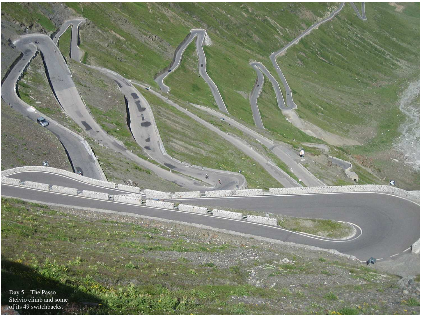
Day 5—The Passo Stelvio climb and some of its 49 switchbacks.

The descent of Stelvio is undoubtedly the most breathtaking scenery of any I have done. Included are some hairpin turns in dark tunnels. Last year I had done the climb but didn’t have enough warm clothes to do the descent. Normally I don’t do a descent if I haven’t earned it by first doing the climb. Since I had