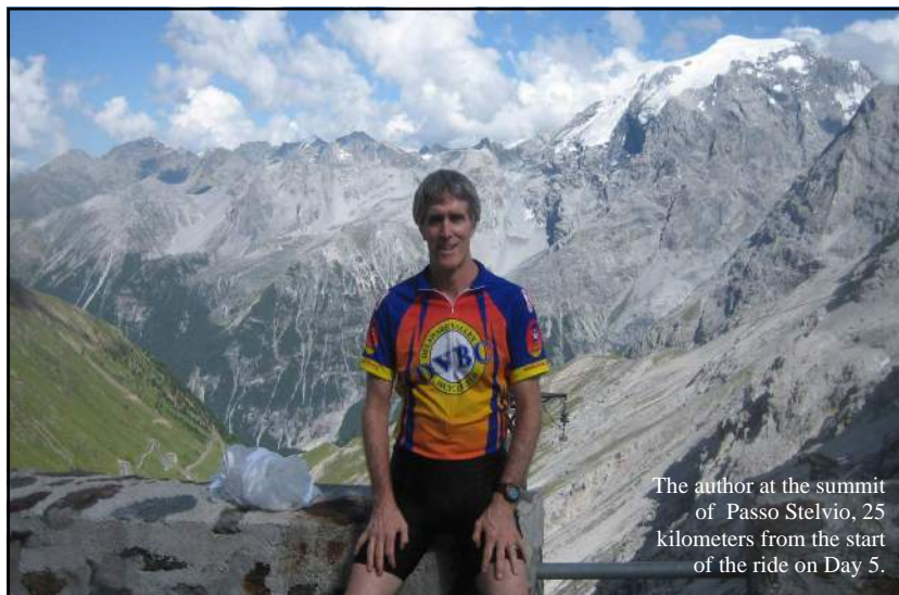
The author at the summit of Passo Stelvio, 25 kilometers from the start of the ride on Day 5.