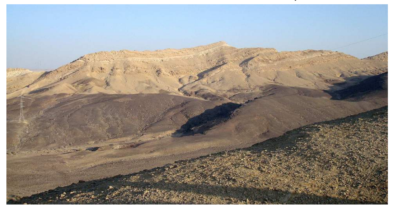
BELOW: The Negev Desert in Israel, where Shelley became a mountain biker.

[NOTE TO DVBC MEMBERS AND FRIENDS: I am planning another entry-level mountain biking and touring trip to Israel for September of 2010. For more info, e-mail me at 4epsteins@comcast.net.]